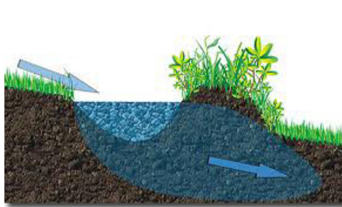
Native plants at the downside of a swale absorbs storm water runoff.